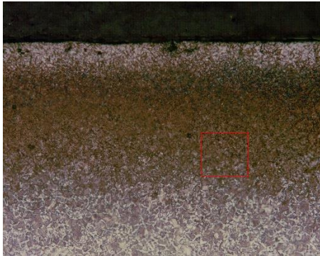
Figure 1: The original image of decarburized steel.