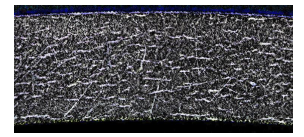
Figure 2: Thin dark objects are highlighted using a gray transformation.