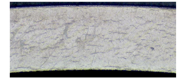
Figure 1: Original image of Zr alloy showing the hydrides at 100X.