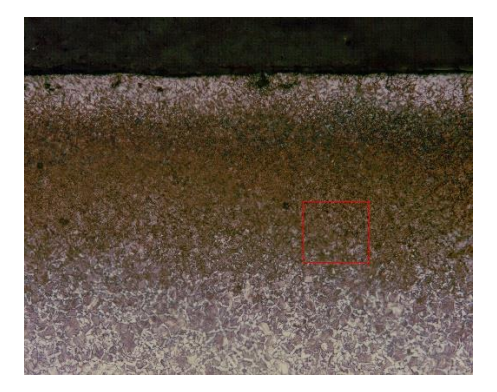
Figure 1: The original image of decarburized steel.